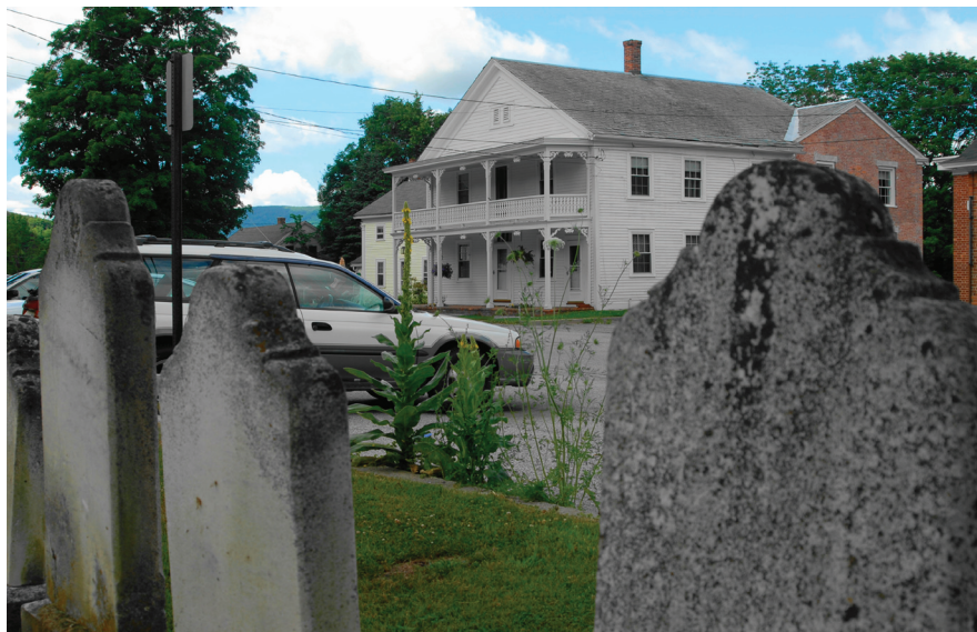
Lampman home viewed from the Pownal Center Cemetery

This home predates the massacre in the streets of Boston, the hanging of the lantern by a silversmith in the North Church. These bricks and mortar stood firmly when the bridge at Concord was being witness to "the shot heard round the world." You read dates like 1700-1728 for the first Dutch Settlers.